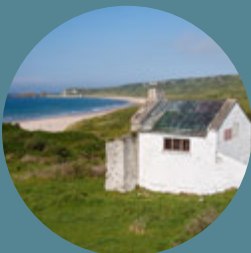
Whitepark Bay Beach

6 Bonamargy Friary, Ballycastle FRANCISCAN FRIARY ESTABLISHED IN 1485