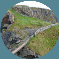
Carrick-a-rede Rope Bridge