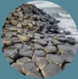
The Giant's Causeway